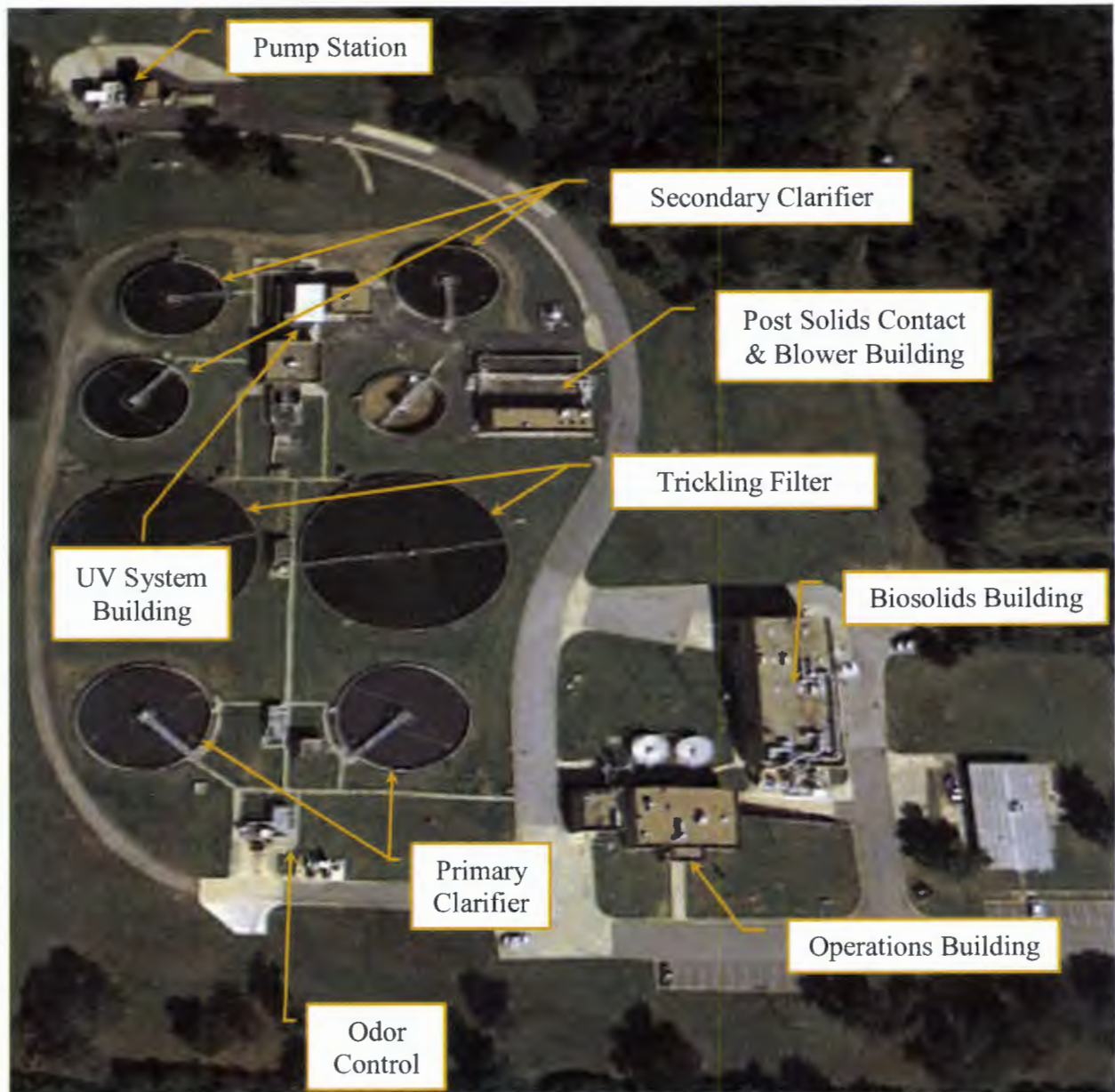
Massard WRF – October 2013 (Google Earth)